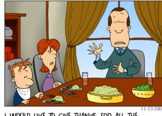
11-23-2006 I WOULD LIKE TO GIVE THANKS FOR ALL THE GREAT YEARS WE HAD BEFORE TOFU-TURKEY AND SOY-STUFFING