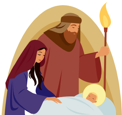
Wesołych Świąt Bożego Narodzenia

Szczerze oddany w Chrystusie, Francis Kardynał George, O.M.I. Arcybiskup Chicago